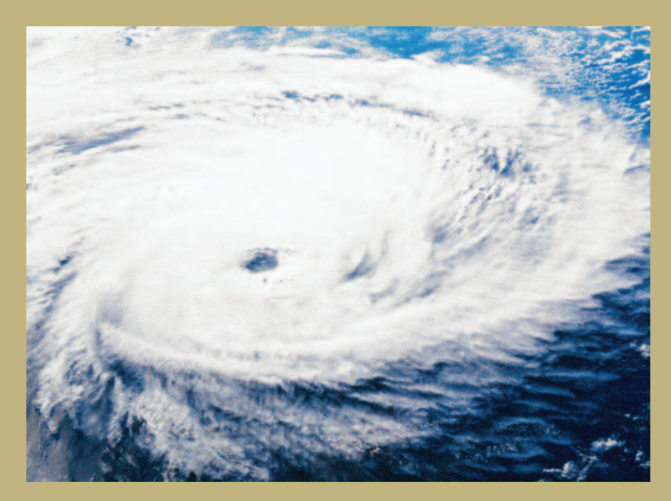
Safeguard Your Home from Storm Damage